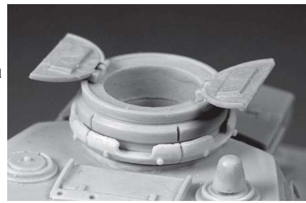
This photo shows the assembled open cupola with gap forward (here seen on a PzKpfw IV)

Step 14. For Ausf G, use the kit cupola parts. However, for the E/F, use the resin early cupola parts. This cupola had an armoured ring which was raised to allow vision through one of the five gaps between the five projecting lips (with a gap in the centre of each) along the edge. This conversion allows two options. The closed cupola (resin part 12) is configured with the armoured ring lowered, and the upper hatches closed. The open cupola (resin